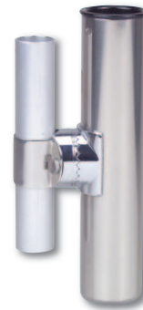
Fig. 1215DP2 for 1-1/4" Dia. Rails