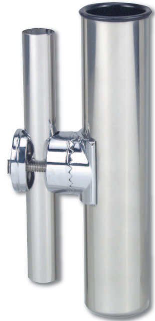
Fig. 1215DP0 for 3/4" to 1" Dia. Rails