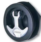
Fig. 1093 Pull

Consult factory for custom colors matches