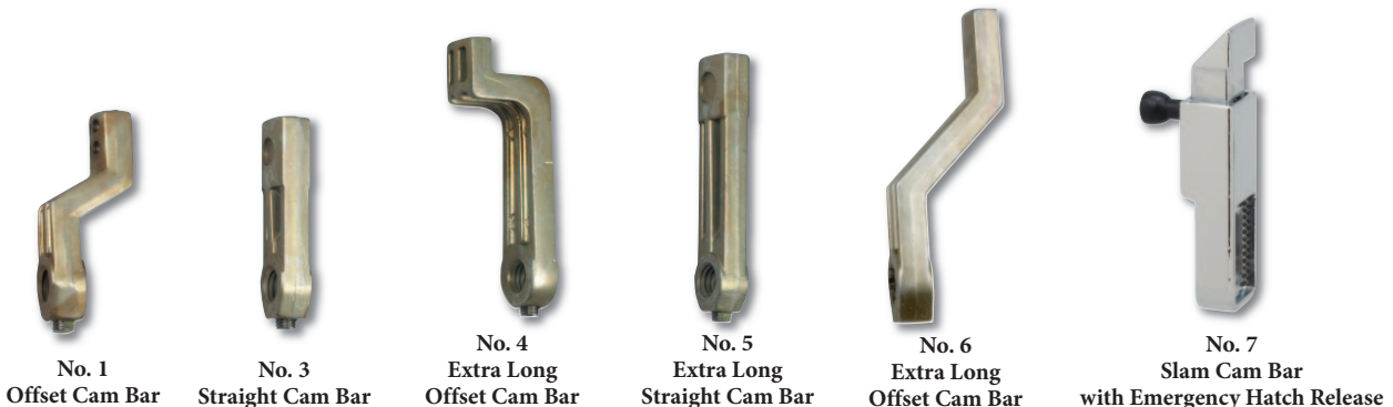
No. 1 Offset Cam Bar