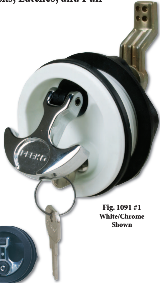
Fig. 1091 #1 White/Chrome Shown

The T - Handle Drops Down Flush in Either the Open or Closed (180° Rotation) Position (Except with the Offset Cam Bar Positioned Upward)