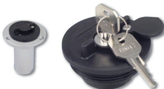
Fig. 0520 Fill Shown with Locking Cap