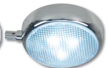
Fig. 1358 With Dimmer Switch (Chrome Shown)