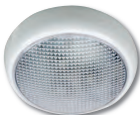
Fig. 1355 Without Switch (White Shown)