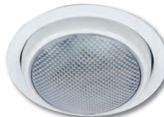
Fig. 1357 With Trim Ring (White Shown)