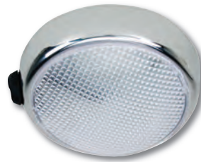
Fig. 1356 With On/Off Switch (Chrome Shown)